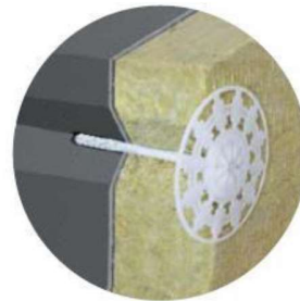
Rys. łącznik z talerzykiem TDX-090 Rys. łącznik z talerzykiem TDX-140