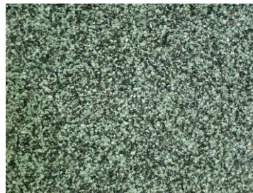
95 - Green