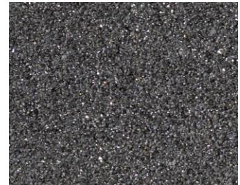
92 - Black