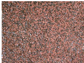
90 - Red