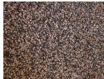
97 - Brown