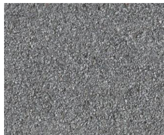
91 - Slate