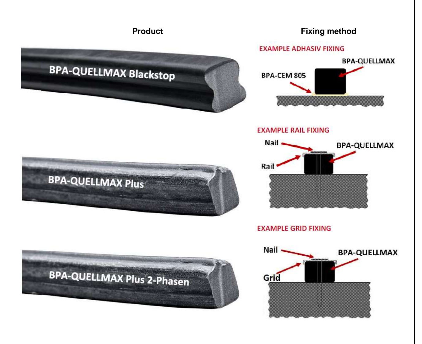
Profile types – BPA QUELLMAX