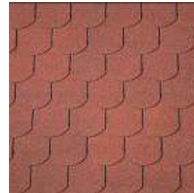
10 - Red