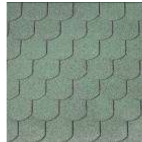
03 - Green