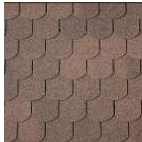
07 - Brown