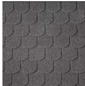
01 - Black